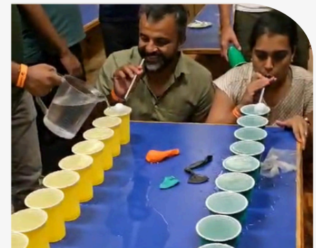
Adults had a great time engaging in a variety of games throughout the night.