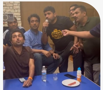
Never a dull moment at Camp Allen