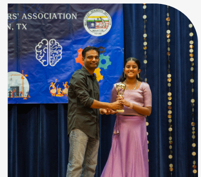
MEA Arts and Chess Competition awards were presented to the winners.