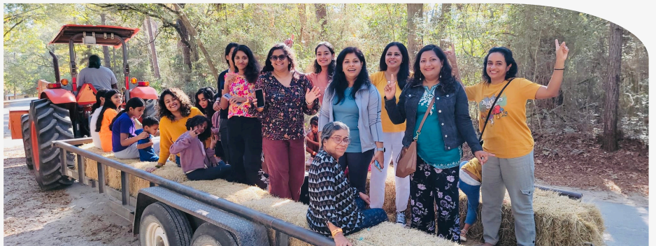
Kids and Adults enjoying morning breakfast and Hay Ride at Camp Allen