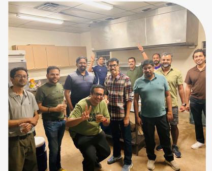
Comradery: Moments in the Making