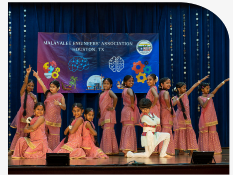
MEA stars stepped into the spotlight, adorned in adorable costumes grooving to the beats.