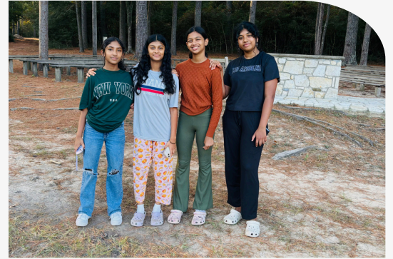
MEA Kids had a blast forging friendships, and embracing nature