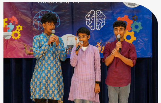
The stage pulsed with the rhythm of music rendered by MEA kids