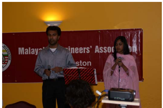
Music at the Fundraiser Dinner.

This year we have Nine Sponsors for Full Scholarships, of which 5 of them are MEA & MEANT members. Two of this year's Sponsors have shown great commitment by contributing a second time now. Over 45 of our members contributed to scholarship fund that helped to collect a net fund of about $8000 in addition to the full scholarship sponsors. Our friends from Austin have also joined us with their contribution. We are in the process of leveraging 'Employee Contribution Matching Grants' with some major US corporations, thanks to our 501-c3 status.